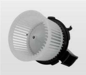
VXPRO EH5098 Blower Motor