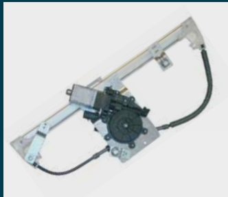
VXPRO ER1473 (Left) VXPRO ER1474 (Right) Window Lift Regulator with Motor