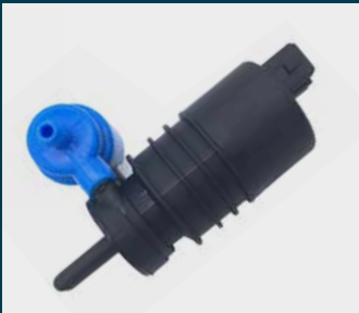
VISIONPRO EW5505 Lucas LRW5505 Washer Pump