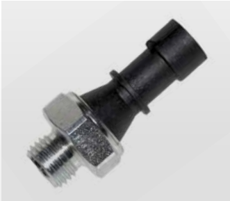
VXPRO EE3202 Oil Temperature Switch

The Fiat 500 (312), launched in 2007, is a modern take on the iconic 1957 original. Its retro-inspired design and compact size make it ideal for city driving, combining style, agility, and efficiency. Competing with the likes of the Mini Cooper and Smart ForTwo, it stands out for its nostalgic charm and everyday practicality. The car has been incredibly well received, securing its place as best-seller in eleven European countries to date and it's still going strong!