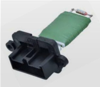
VXPRO EH1059 Blower Motor Resistor