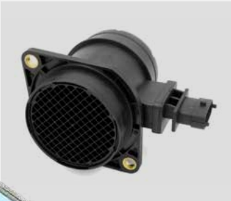
VXPRO EE4078 Mass Airflow Sensor