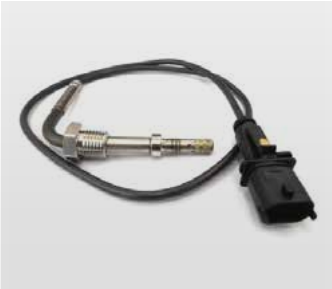
VXPRO EX5005 (EGTS) Exhaust Gas Temperature Sensor