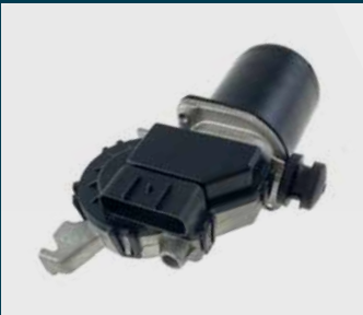
VISIONPRO EW9032 Lucas LRW1032 Wiper Motor (Front)