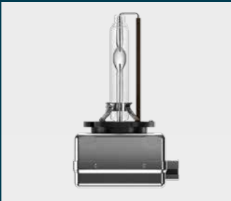
VISIONPRO EB0101SB Lucas LLD1S Xenon Headlight Lamp