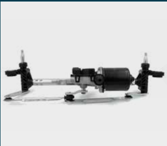
VISIONPRO EW9060 Lucas LRW1060 Wiper Linkage + Motor