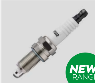
Lucas LSP002 Spark Plug