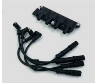
VXPRO EE5056 Ignition Coil with Leads