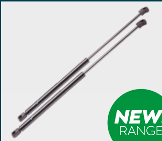
Lucas LGS1410 Gas Spring Rear Hatch