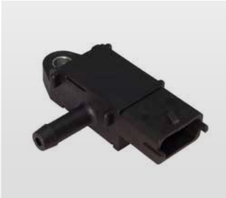
VXPRO EE2723 (EGP) Exhaust Gas Pressure Sensor