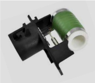
VXPRO EH1061 Radiator Fan Resistor