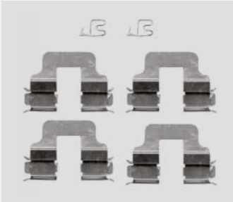
VXPRO EA8513/ EA8514 Front / Rear Brake Pad Fitting Kits

Many more compatible references available.