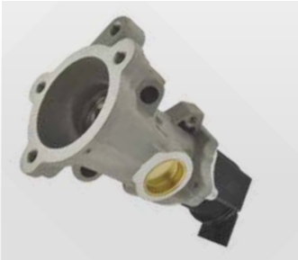
VXPRO EE6003 (EGR) Exhaust Gas Recirculation Valve