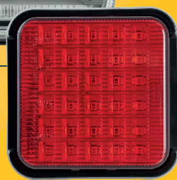
30 LED FOG LIGHT