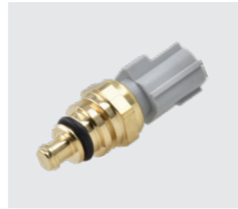
VXPRO EV0031 Coolant Temperature Sender Unit