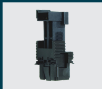
VXPRO EV1027 Brake Light Switch