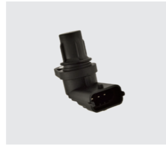
VXPRO EE0024 Camshaft Position Sensor

The Range Rover Sport I (L320) (2005–2013) combines luxury, performance and genuine off-road capability in a distinctive and versatile SUV. The first-generation Range Rover Sport became popular for its commanding driving position, refined interior and impressive towing ability. Today, the L320 remains a popular choice among enthusiasts and families alike, valued for its rugged capability, strong road presence and blend of luxury and utility.