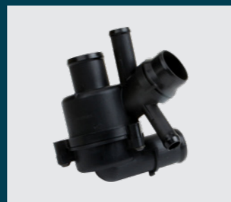
VXPRO EH2160 Thermostat Coolant