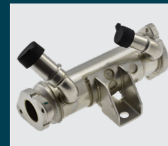
VXPRO EE6922 EGR Cooler