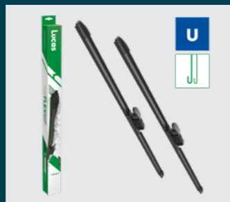
Lucas LWTF2222 Lucas AirFlex Twin Set Wiper Blades (U Hook)

This is only a small selection of the Range Rover I compatible components on offer from ELTA Automotive. Full listings can be found on TecDoc, MAM AutoCat and our new eCat using the address below or the QR on the right.