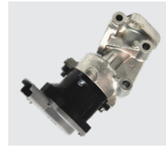
VXPRO EE6033 EGR Valve