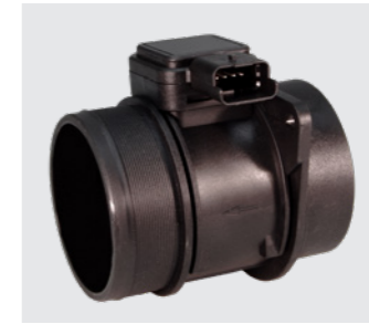
VXPRO EE4044 Mass Airflow Sensor