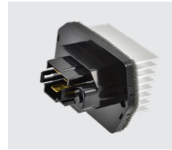
VXPRO EH1050 Interior Blower Resistor