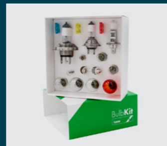
Lucas LLZ012 New Lucas 12V Bulb Kit