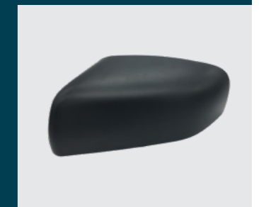
VISIONPRO EM0374 / EM0375 Left / Right Mirror Cover