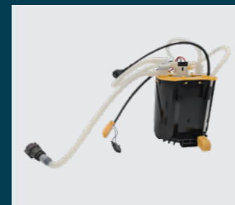
VXPRO EF4152 Fuel Feed Unit