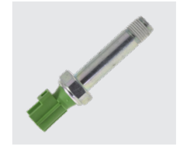
VXPRO EE3303 Oil Pressure Switch