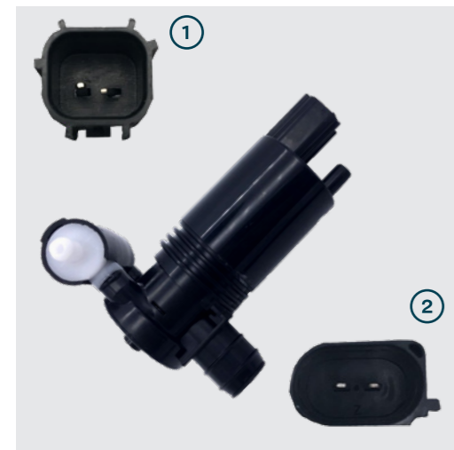
Lucas Washer Fluid Pump ① LRW5542 - Window Cleaning ② LRW5571 - Headlight Cleaning