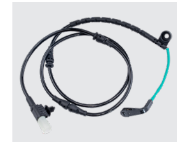
VXPRO EA5053 Brake Pad Wear Warning Contact